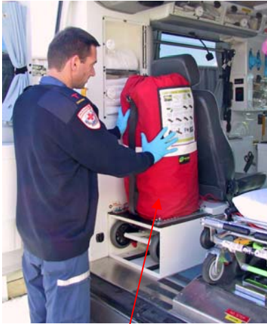
Place VIM carry bag onto the baggage area of the Ambulance