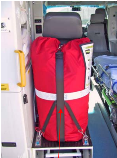
Carry bag correctly secured