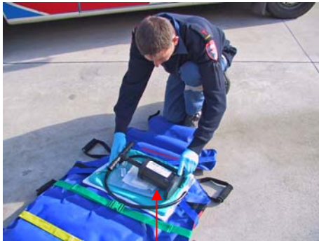
Place additional equipment on the VIM