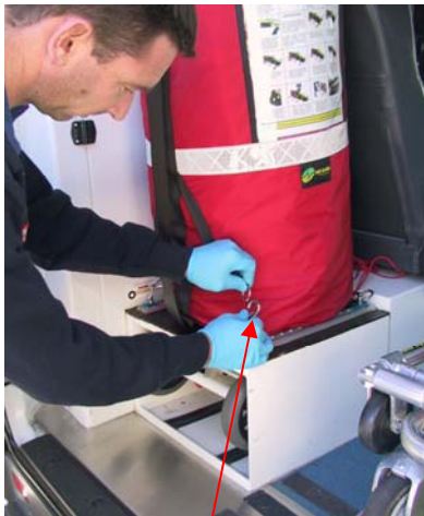
Attach webbing strap to the carabineers