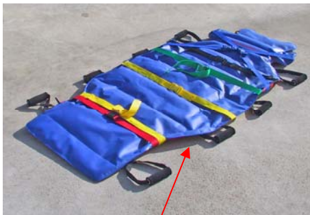
Place VIM on clean surface, clear of debris