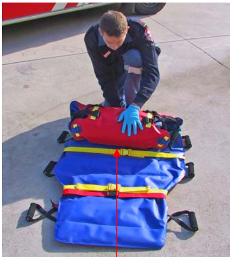
Carefully roll up the VIM