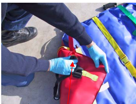
Open the air valve on the VIM

Ensure beads are spread evenly and appropriately.