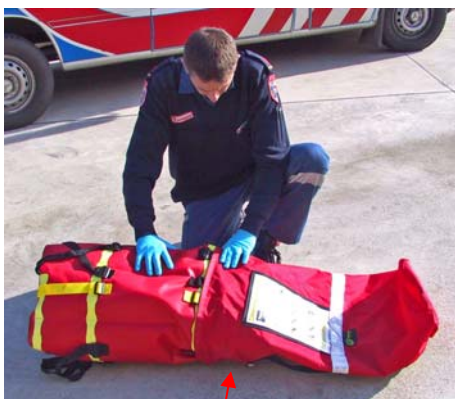
Slide VIM into the carry bag

If air becomes trapped in the VIM, pressure will build up within the VIM, causing the seam to fail.